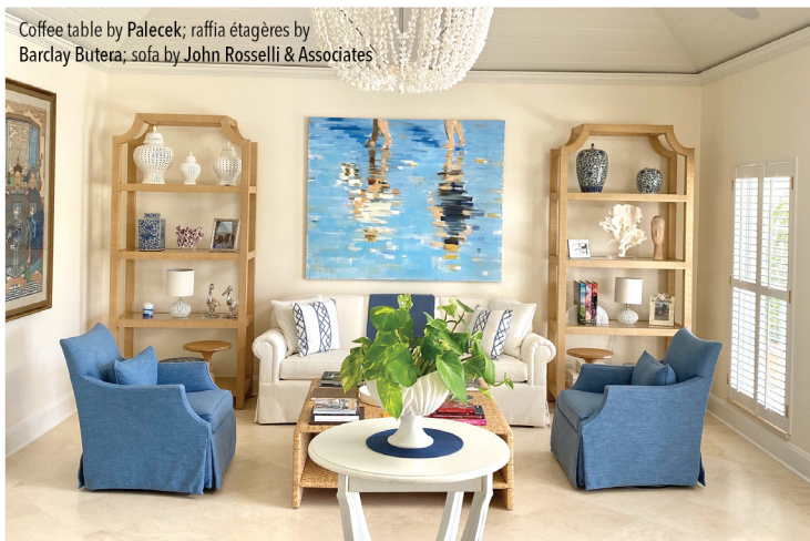
Coffee table by Palecek; raffia étagères by Barclay Butera; sofa by John Rosselli & Associates