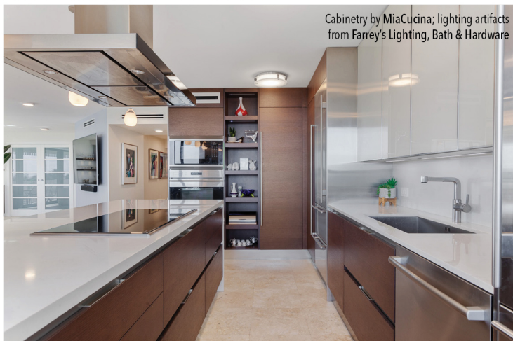
Cabinetry by MiaCucina; lighting artifacts from Farrey's Lighting, Bath & Hardware